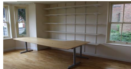
Study with own access to outside