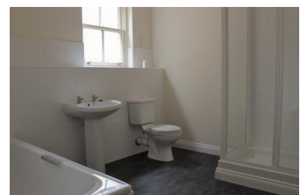
Main Bathroom with bath and walk in shower