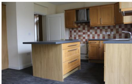
Dining Kitchen with utility room