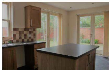
Dining Kitchen with doors to garden