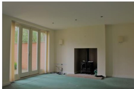
Sitting Room with wood burning stove