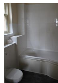
Master Bedroom En-suite