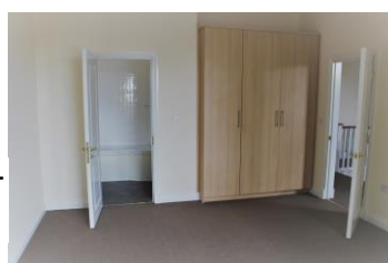
Master Bedroom + En-suite + fitted wardrobes